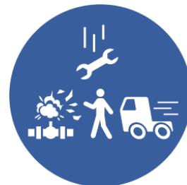
LINE OF FIRE