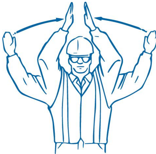
Face palms forward with hands above head Bring elbows forward and hands together