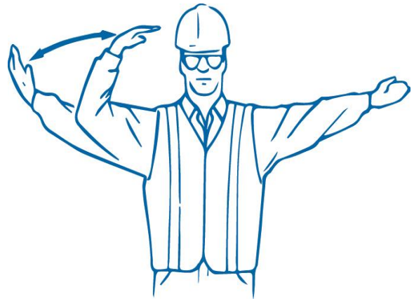
Bend monitoring arm repeatedly toward head to indicate continued turning