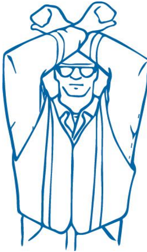
Cross both arms above head