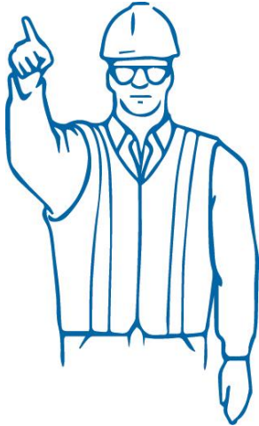
Point at the driver and gain eye contact