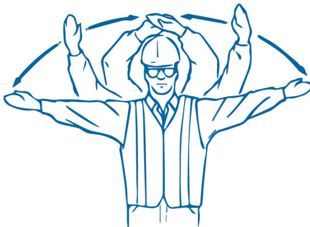
Cross both arms above head Extend downward repeatedly until vehicle stops