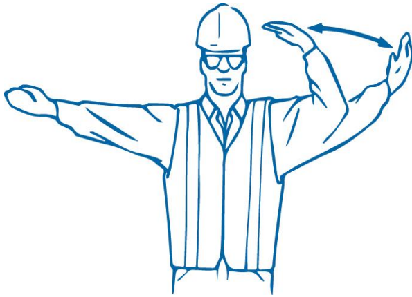
Point one arm to indicate the direction to turn