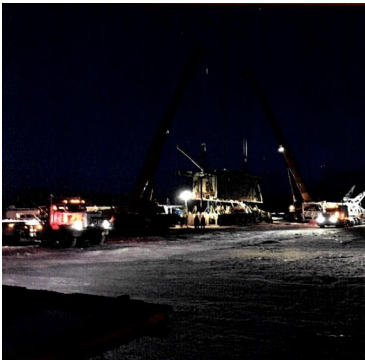
Poorly lit work sites, high activity levels and heavy loads require extra planning and diligence

Lighting is designed for 24-hour drilling operations, but not for rig moves. If lights are blocked by equipment or vehicles during a rig move, shadows can limit visibility and increase the probability of incidents.