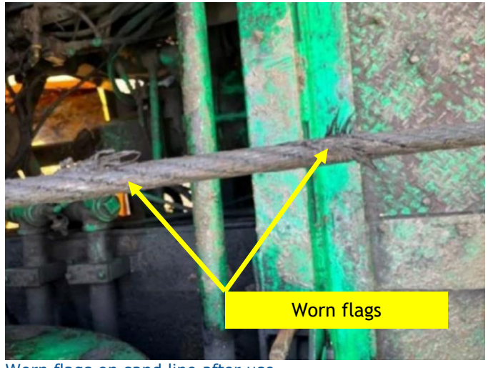
Worn flags on sand line after use