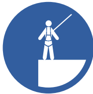
WORKING AT HEIGHT