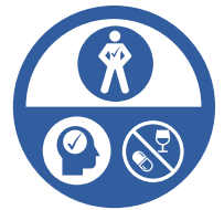
FIT FOR DUTY