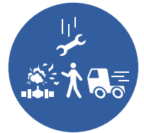
LINE OF FIRE